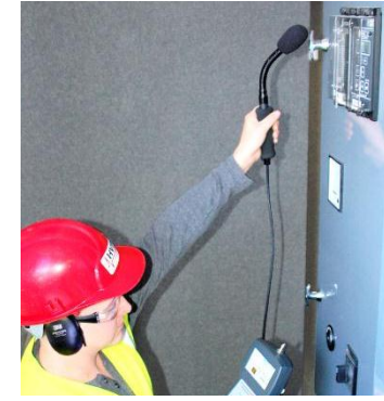
Optional Indoor Acoustic Probe (PDSIAP) in use with Headphones. Outdoor Parabolic Receiver (PDSOPR) also available.